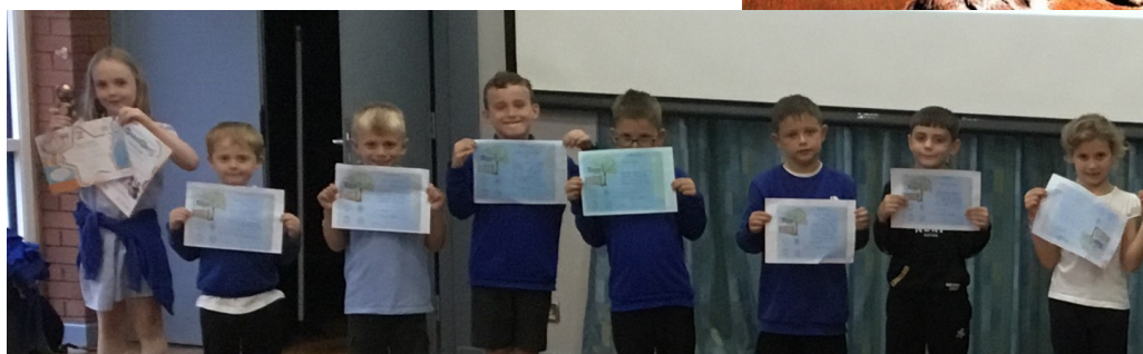
Highgate Awards: Well done to this week's Highgate Award Winners.