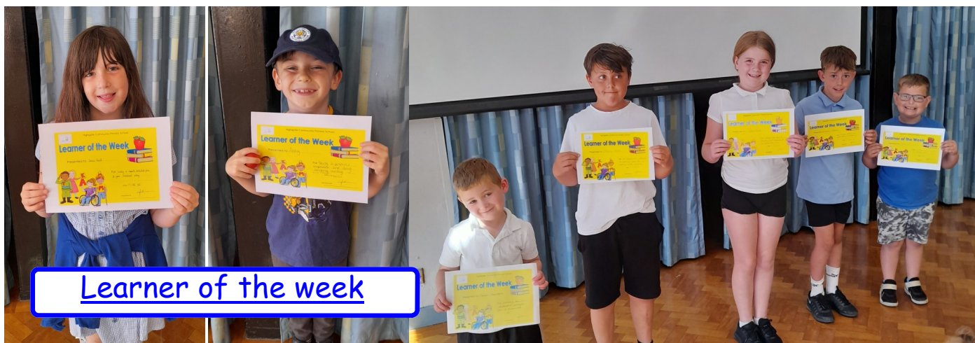
Learner of the week