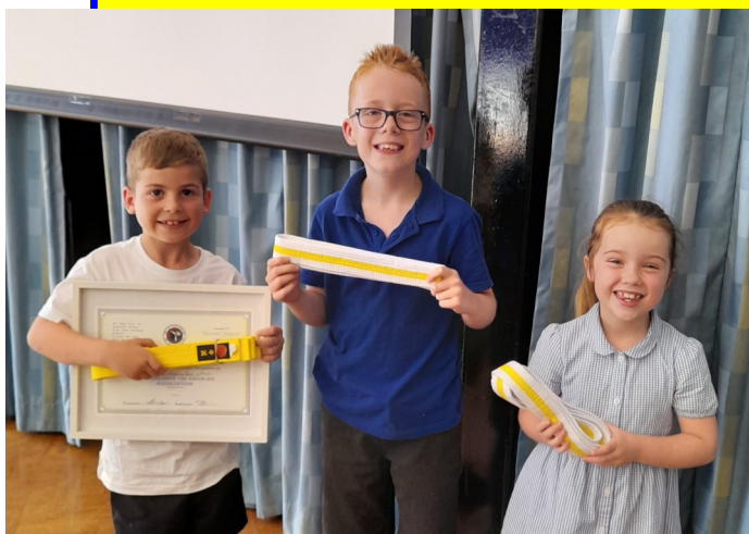
Achiever of the week

Well done to these fantastic pupils who have earned gradings in Taekwondo and international cheerleading in Barcelona!