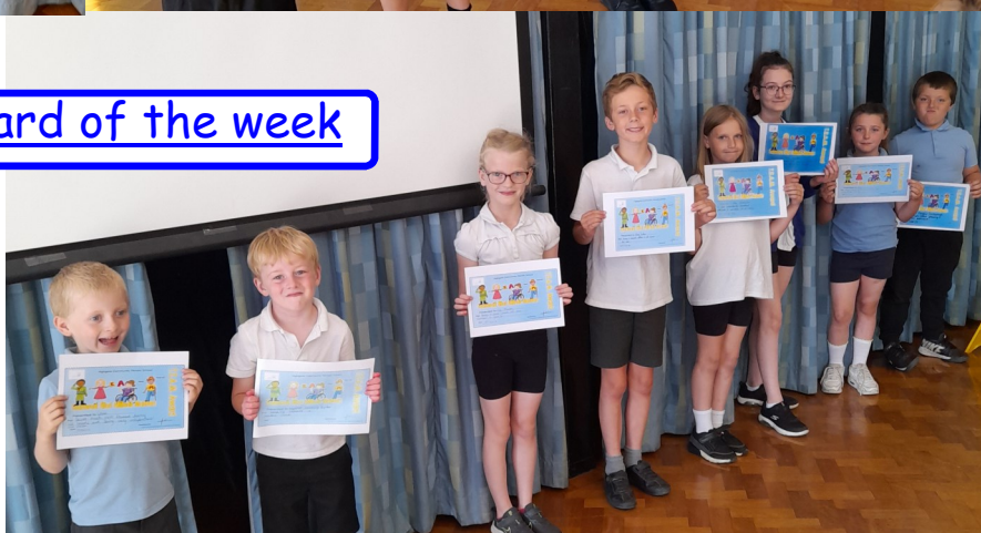
Team Award of the week