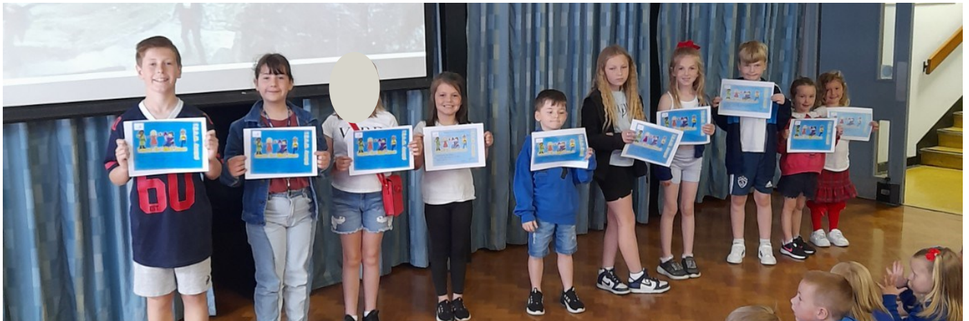
Team Award of the week