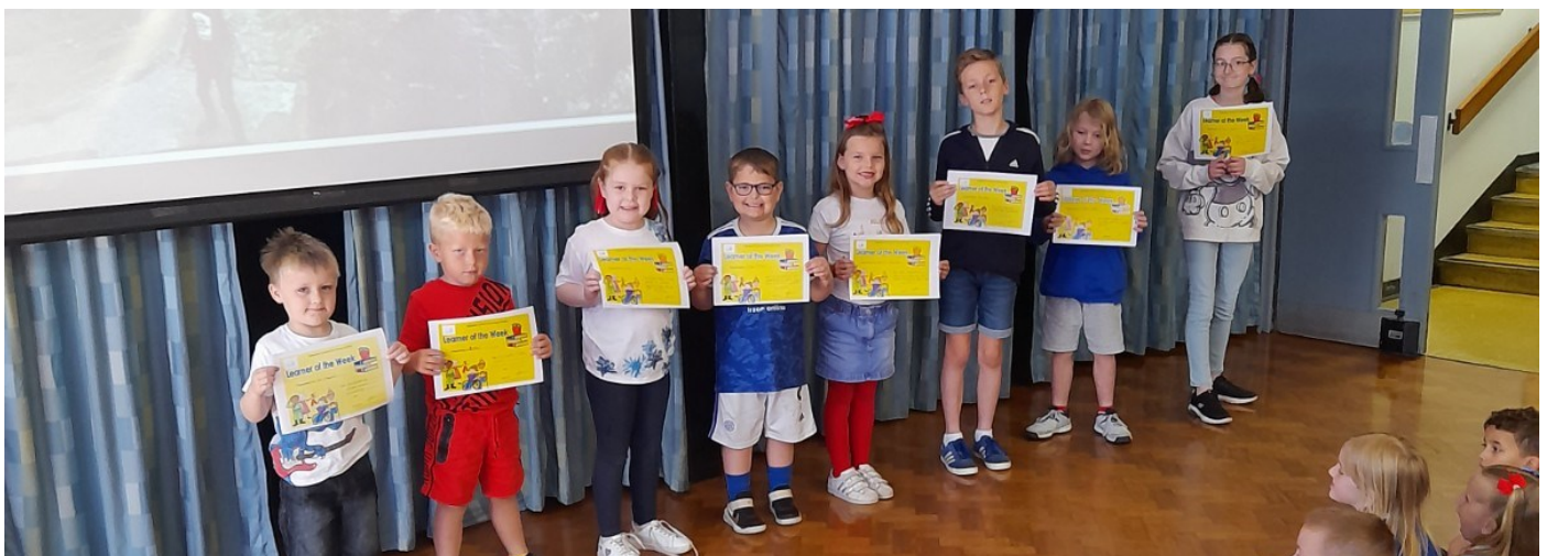
Learner of the week