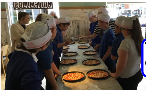
Year 6 Pizza express/ Geography field trip