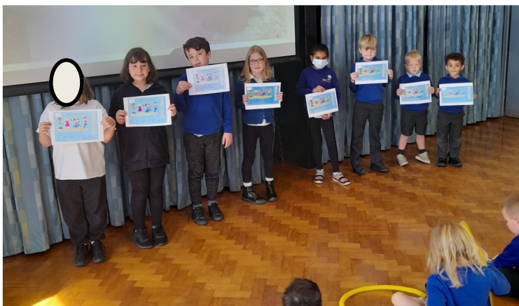
Team Award of the week