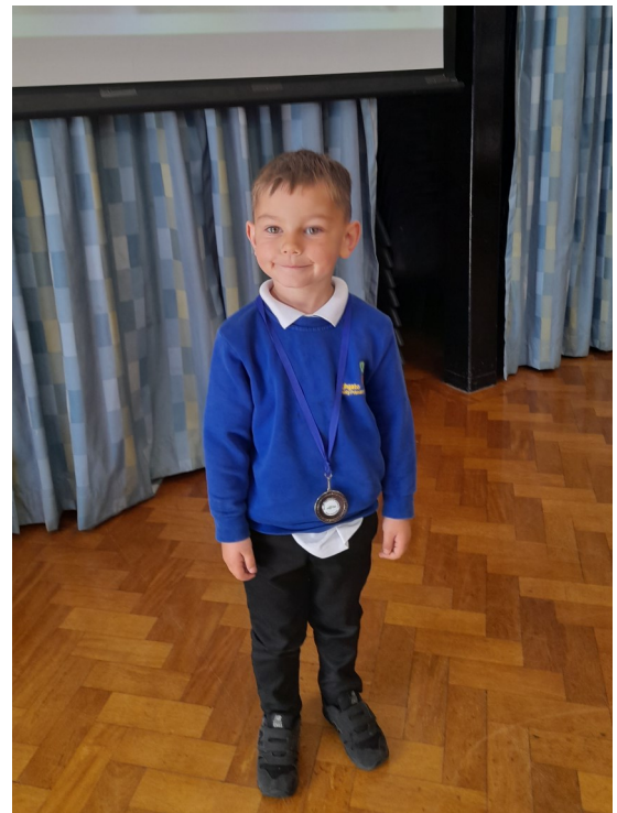
Achiever of the week