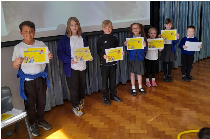
Learner of the week