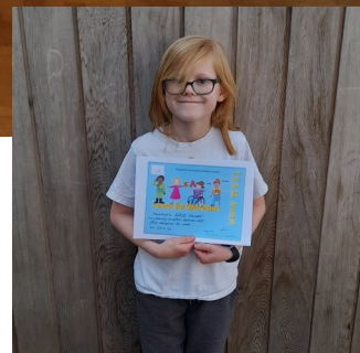
Team Award of the week