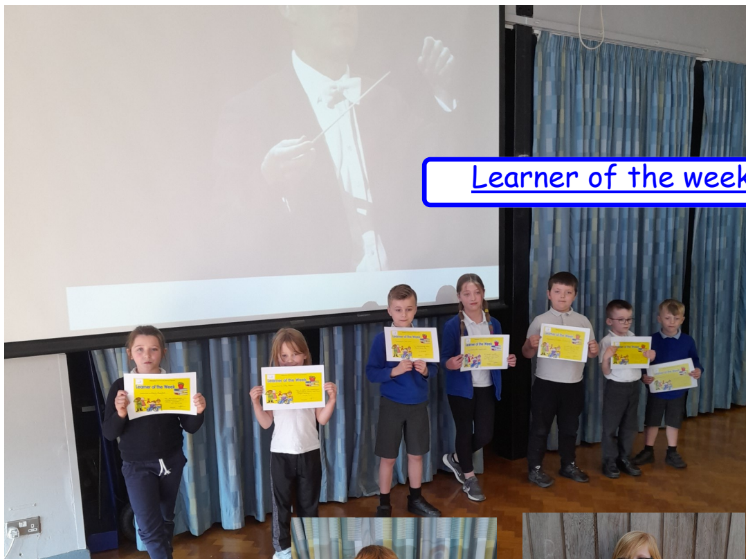
Learner of the week