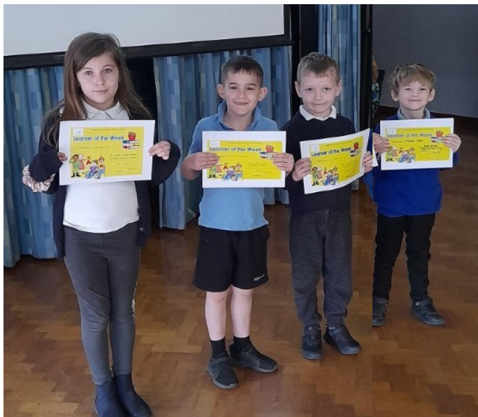
Learner of the week