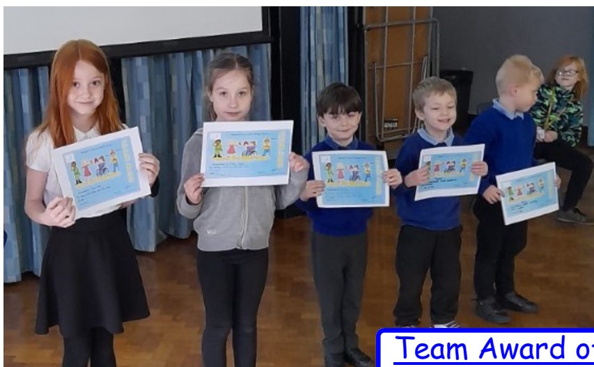
Team Award of the week