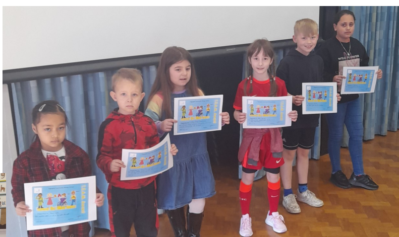
Team Award of the week