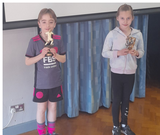
Achiever of the week