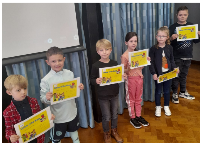
Learner of the week