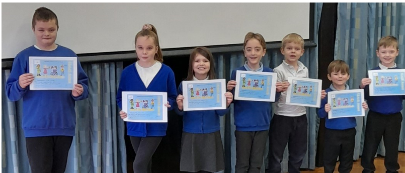
Team award of the week