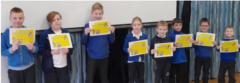
Learner of the week