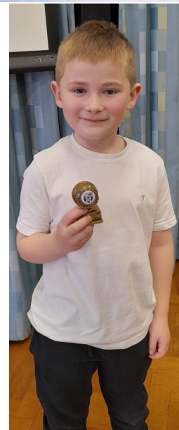
Man of the Match