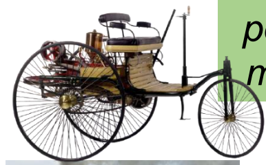
petrol powered motor carriage