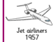
Jet airliners 1957