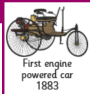
First engine powered car 1883