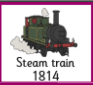
Steam train 1814