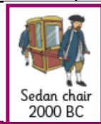
Sedan chair 2000 BC